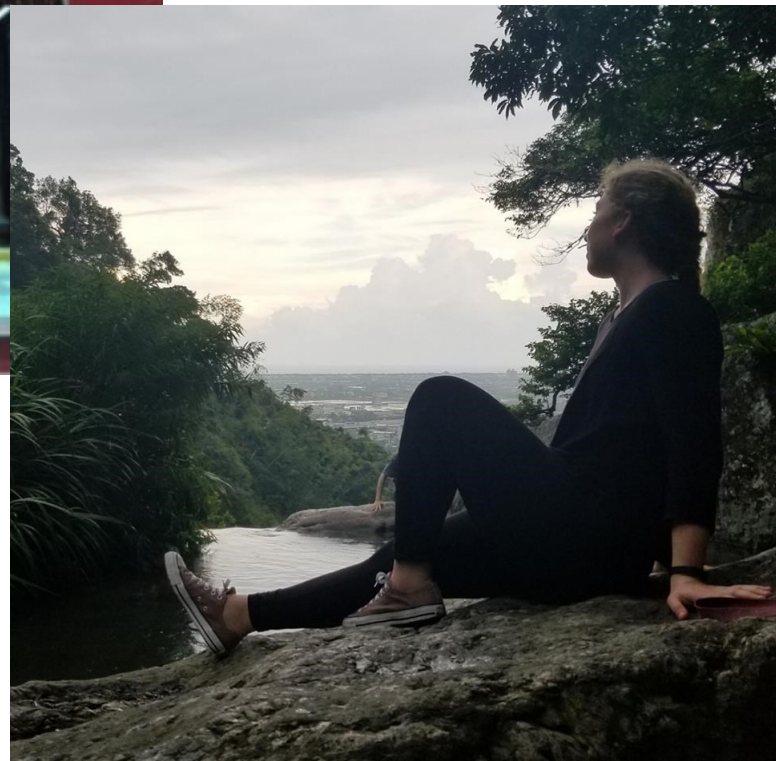
Below: It's just beautiful here!