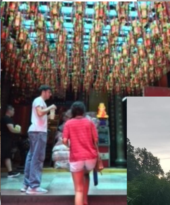
Left: Paper lanterns in a different temple in a modern downtown area called Ximen.