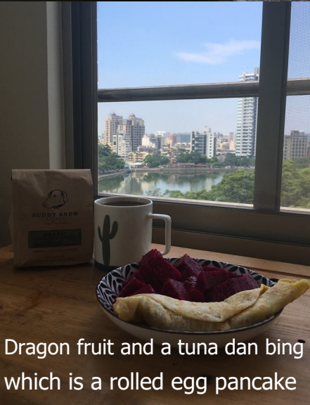
Dragon fruit and a tuna dan bing which is a rolled egg pancake