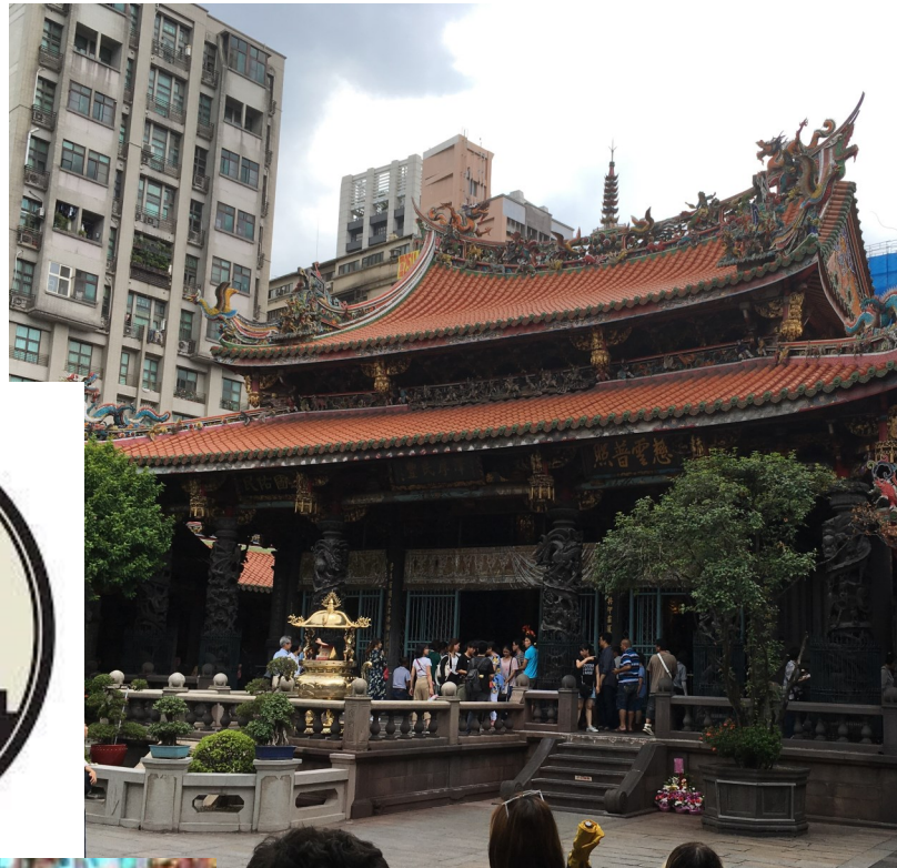
Above: Longshan Temple