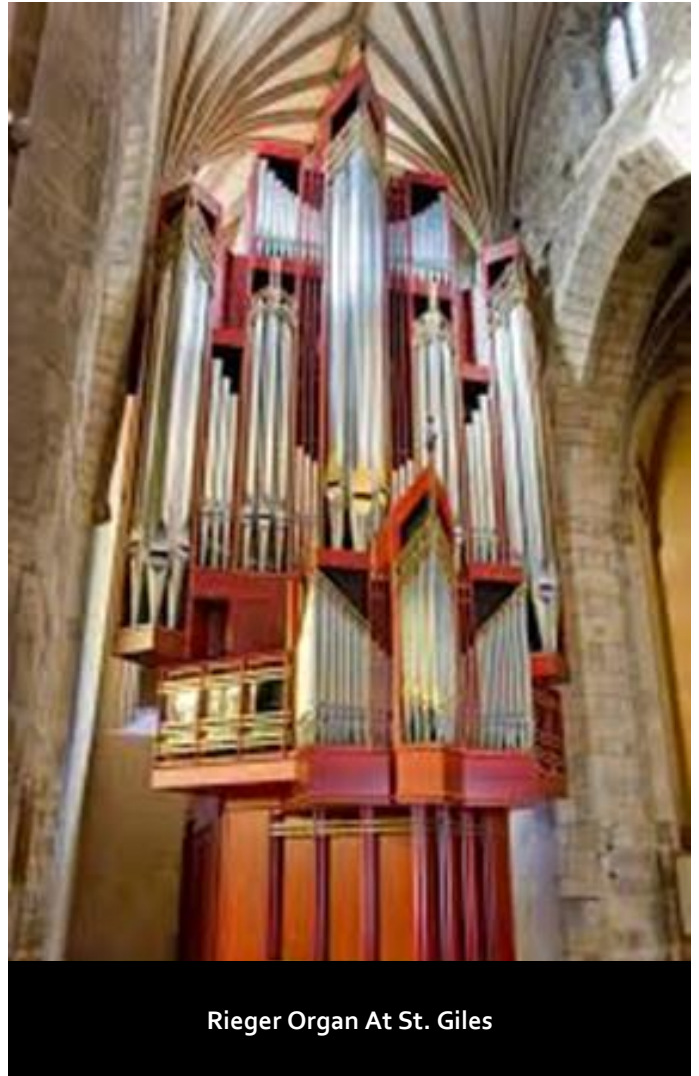
Rieger Organ At St. Giles