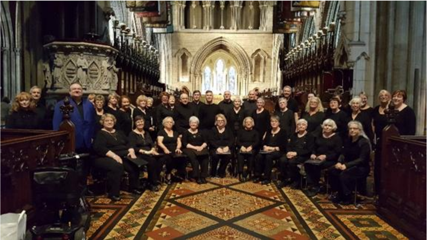
Celtic Encore Choir at St. Patrick's Cathedral in Dublin, Ireland