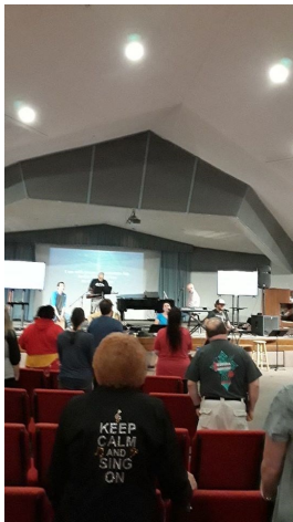
Worship was Inspiring

"I especially appreciated the vulnerability and authenticity expressed by the leadership there."