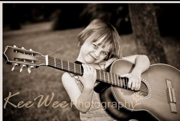
KeeWee Photography: The Family Photographer! Tampa 727-326-2219