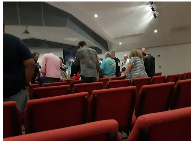
Impromptu Healing Ministry