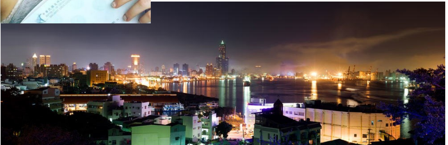
Taipei, Taiwan at night