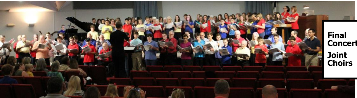
Final Concert Joint Choirs